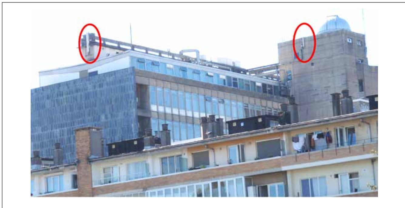
Fig. 1. The two communication masts causing most of the electromagnetic field of 70 - 100 \mu\text{W}/\text{m}^2 in one of the experimental rooms. Fig. 1. Los dos mástiles de comunicación causantes de la mayoría del campo electromagnético de 70 - 100 \mu\text{W}/\text{m}^2 en una de las salas experimentales.

Germination did not occur under 70 - 100 \mu\text{W}/\text{m}^2 . After four days, the seeds set under the two different electromagnetic field strengths already differed: those under the lower level had begun to germinate while those under the higher level of electromagnetic field had not at all done so. After seven days in total, many seeds maintained under low level of exposure had completed their germination and other ones were in the process of their germination while the seeds set under the higher level of exposure appeared unchanged (when looking at them from above) (Fig. 2 A). The experiment was continued until a total of 10 days with, at that time, the same results as above: normal germination for the seeds under low radiation, apparently no germination for those set under the higher radiation.